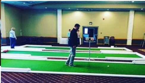
Making sure the three courts were ready to go.