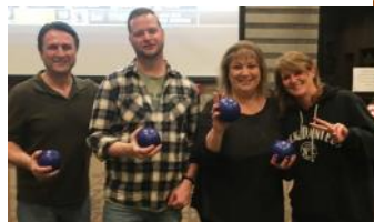
2nd place team: BOCCE BALLBOA