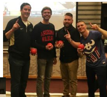
1st place team: FUGAZI'S

By the way, we will have bocce ball at Festa Italiana . Please visit and share the event on our website and Facebook !