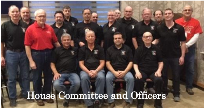
House Committee and Officers